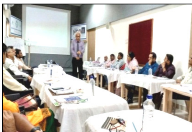
NGO Management training, Navsari

Donation Detail for the Social cause are as follow