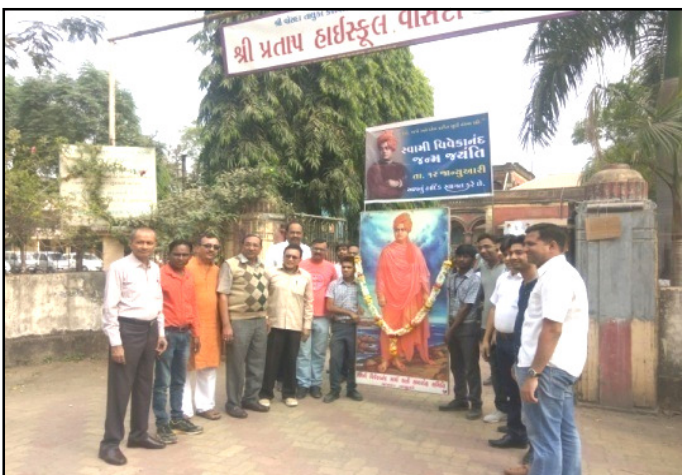
Rally was held on Birth Anniversary of Swami vivekananda

During adolescent health programs, students are educated about ill effects of various addictions and also given information on vocational training .