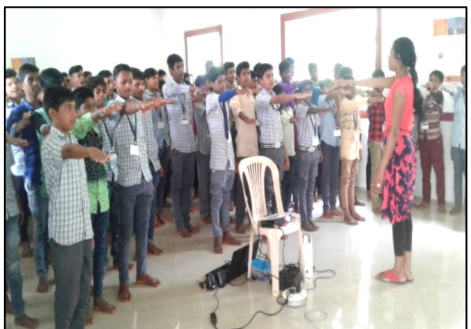
Students are taking pledge for "No addiction"