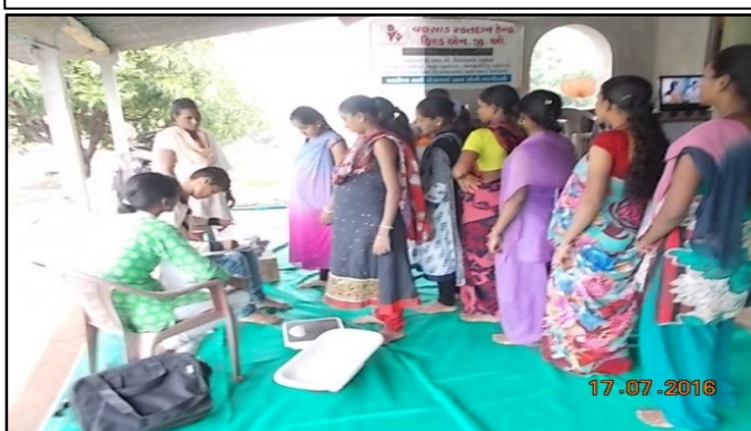
OPD and registration of patients at general camps