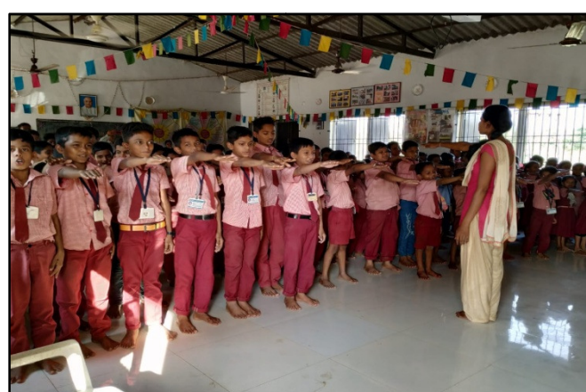
Students of primary schools taking pledge for cleanliness and de-addiction