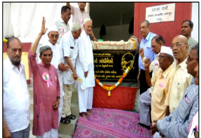
Social workers at Gandhi Mela, Navsari