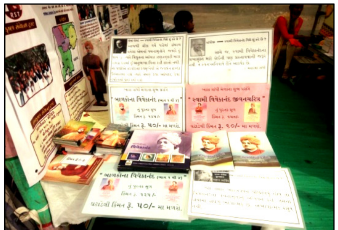
Exhibition and Distribution at Concessional rate