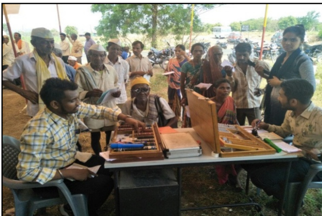
OPD services at eye camp