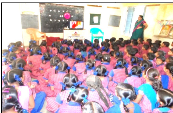
Students at Primary schools watching video titled “Three advices of Meena”