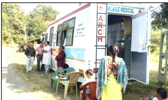
Dental camps in interior village, Khataamba