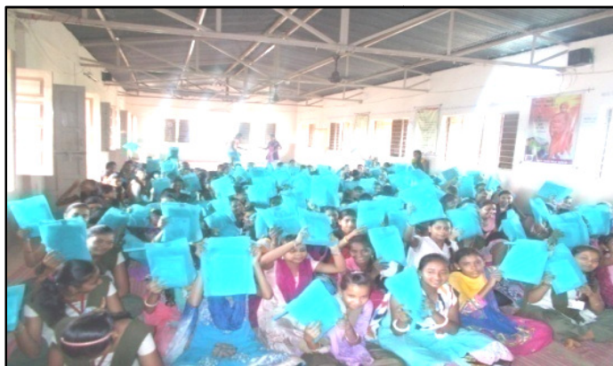
Adolescent girls with menstruation kit made of flalin cloth.