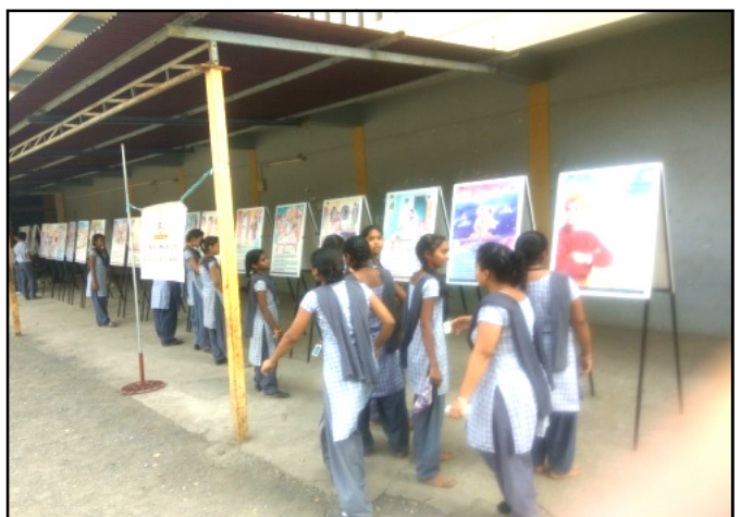
Exhibition on Youth Day