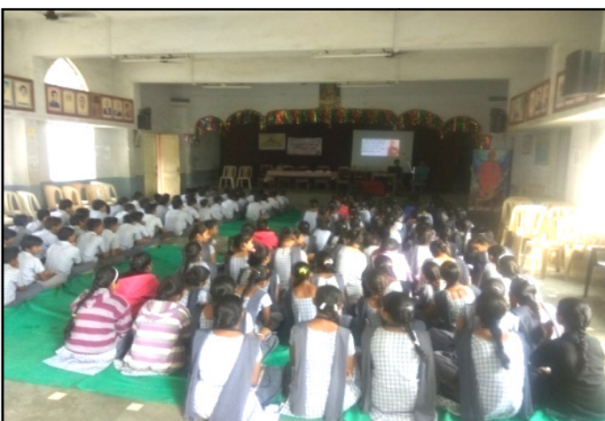
Video being shown on Life and messages of Vivekananda and on deaddiction.