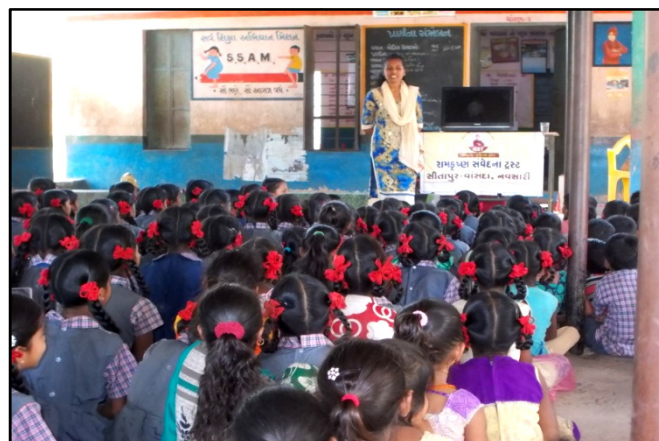
Awareness on cleanliness to the students of primary schools