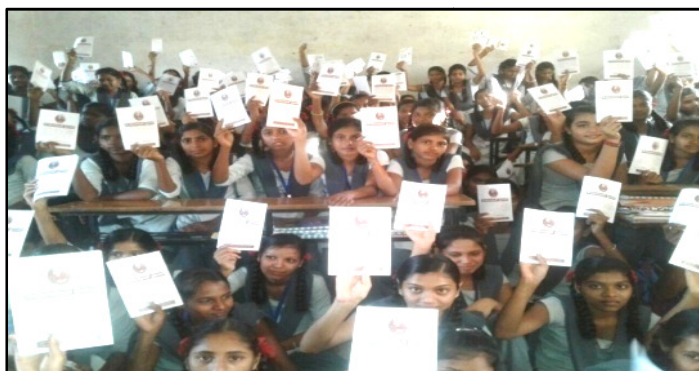
Adolescent girls with book title "Kishoravasthani Munzvano"