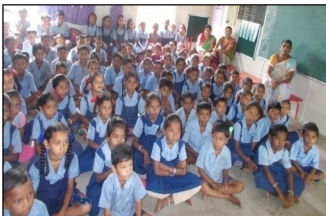
Students of primary schools watching awareness videos