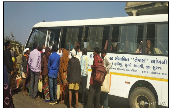
Patients boarding bus for their operation