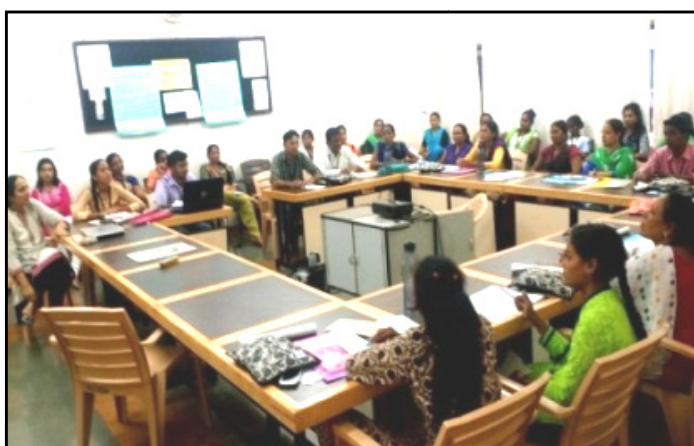
TOT training, SEWA Rural Jhagadia