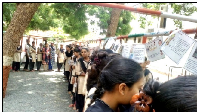
Adolescent girls viewing poster exhibition on adolescent health